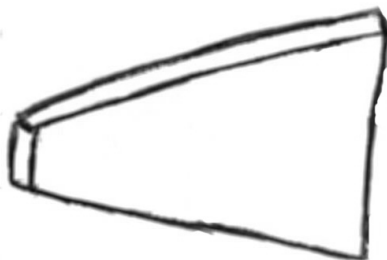
Step One Starting stock