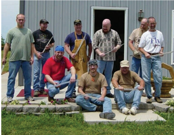
A previous class in 2004

Please send your registration information and payment to: NJBA PO Box 224 Farmingdale NJ 07727-9998