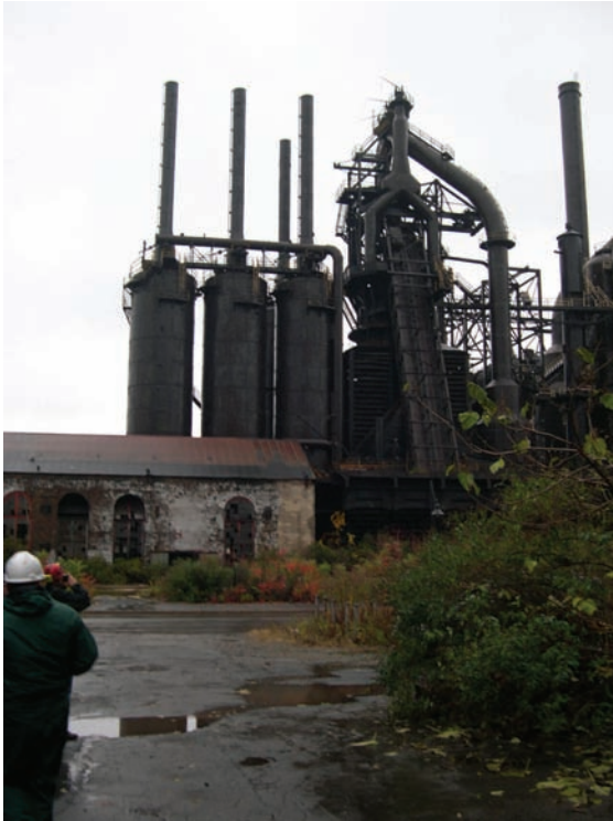
Employee belonging and changing room