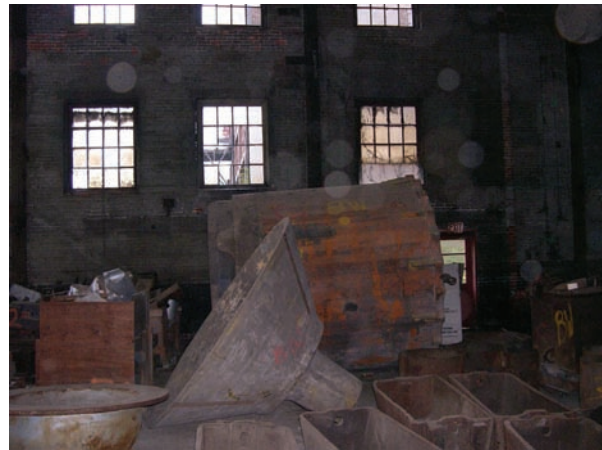
Patterns stored in the first shop, look at the last picture for scale, as that piece is in the foreground here!

terns, the tubs that were used to charge the iron in the furnaces with other needed elements, a fire engine from their fire department and many other items.