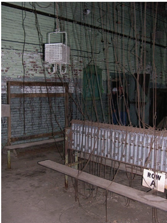
Flywheels for the blowing engines

The blowing engines ran on carbon monoxide that was a byproduct of the furnace and were used to compress the air that was fed to the pre-heaters and the blast furnaces. There were two men who were working on rebuilding one of the blowing engines who gave a very good description of how they worked and showed us the parts that were around to help with the explanation.