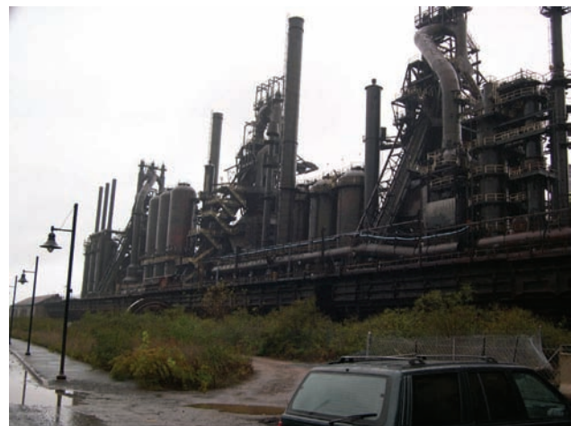
Partial view with three furnaces

We then proceeded to one of the buildings the workers used to change their clothes and wash up in. There are still the locking chains with hooks and baskets they used to put their belongings in and on and pull them up toward the ceiling and lock the chain in a tube below. We then went to the building that housed the blowing engines.