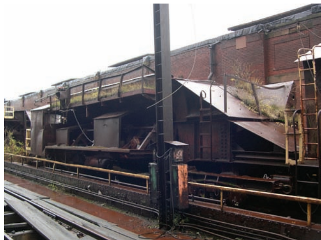
Special rail cars used to move materials for the furnaces

We went from there to the blast furnace, where the troughs are still in the floor from where they tap the slag and the metal and control the molten metal as it runs by a series of gates into huge crucibles which are then taken to where the iron would be poured into molds. The two guys from the blowing engines were still with us and described the operation of the