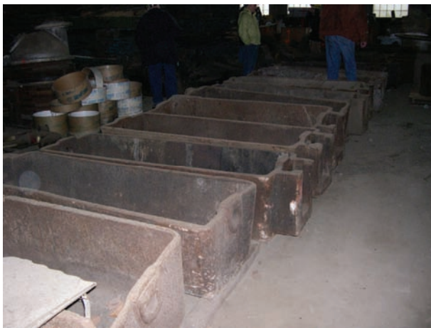
Tubs for charging furnaces