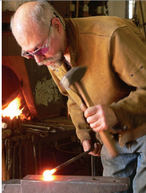
The result is seen the last picture